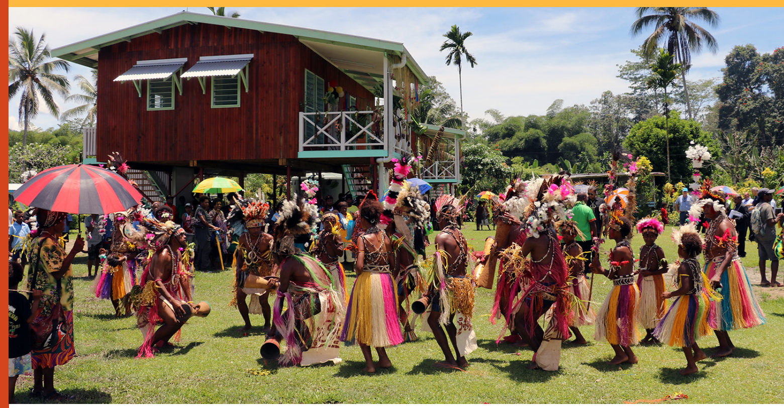
Villagers of Kokoda Station perform a traditional dance to welcome Australian Minister for International Development and the Pacific, Senator the Hon. Concetta Fierravanti and open news buildings on Kokoda Day