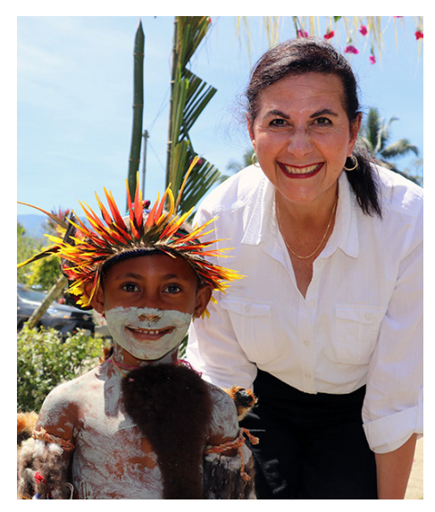
Australian Minister for International Development and the Pacific, Senator the Hon. Concetta Fierravanti, meets with a local boy during the Kokoda Day ceremony

Through the Papua New Guinea – Australia Partnership, the Kokoda Initiative has built 23 double classrooms and five health facilities since 2008.