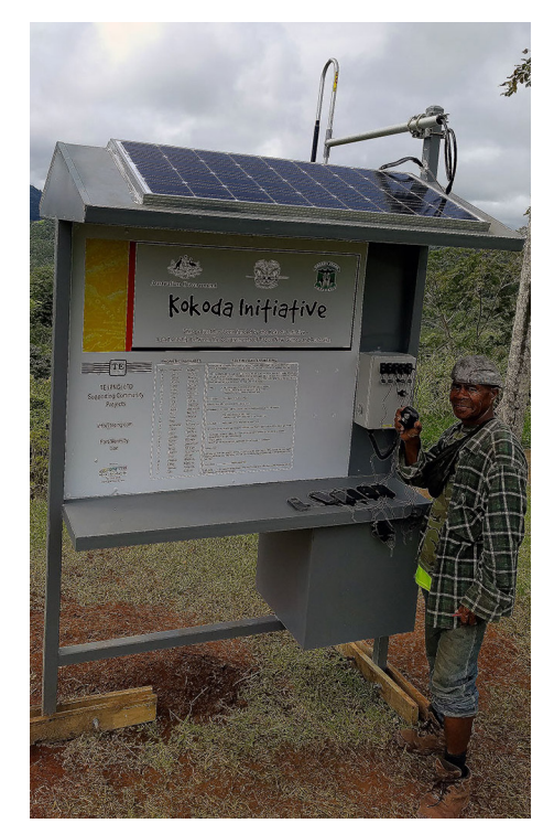
A man uses a Kokoda Track Authority solarpowered radio at Girinumu after being upgraded