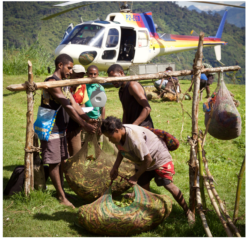
Heli Support agents at Efogi village weighing vegetables brought in by locals.

These flights are very affordable and on average transport 25 people to and from villages daily with them being able to get door to door service unlike ever before. Heli Support also employs 15 local agents in various villages who assist in this new vegetable market.